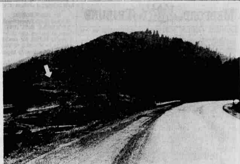
THE SHORTEST DISTANCE — When the Interstate 5 freeway through the Siskiyou mountains from Ashland to the state line is completed, there will be considerably fewer curves than in the present highway. This fact is illustrated by the above photo which shows a portion of the freeway under construction (at left) and the present highway (at right) at a point a few miles south of Ashland. The existing highway curves off to the right a ways and then drifts back across the freeway route at the point designated by the arrow. But the freeway will come straight down the hillside, following an imaginary line from the arrow to the center of the bottom of the photo.

Other business conducted at the meeting included a collection taken for the Laura Settle Scholarship fund. A letter was read with reference to the Northern California sectional