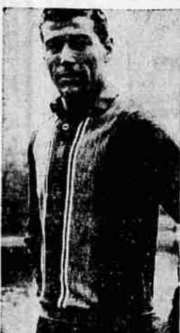
SPORT SHIRTS—For cool days this knitted sport shirt, with contrasting stripes, combines comfort with smart appearance.

What's newest in pattern for fall foundations is fake fur! Look-like leopard, mink and ocelot have been introduced to corsetry, and so has a lizard print. Modernistic designs and feminine florals provide a pretty alternative. Colors are newly subtle as well as bright, with a range of attractive beiges in skin-flattering tones.