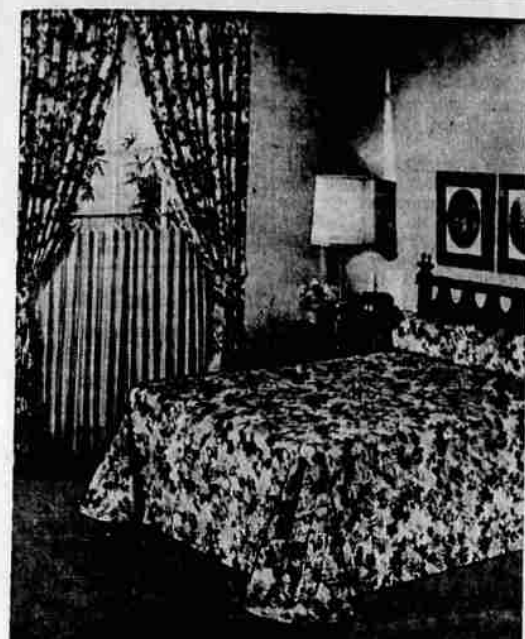
QUILTED SPREAD—Ready-made elegance comes into a master bedroom with floor-length draperies and quilted bedspread in brilliant gold and soft brown print. Cafe curtains, gold carpeting and walls, gleaming brass lamp and rich wood tones of the furniture complete the picture.