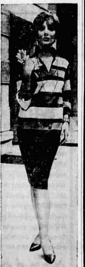
TWO-PIECE KNIT—Ideally adapted to the easy, natural silhouette are knits, such as this two-piece style with boldly striped top, so-called skirt.