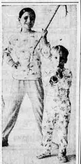
SLEEPER SETS—Fashion follows the youngsters right up to bedtime with four-part wardrobe sleeper sets that coordinate mix-match prints and solids.

How about Industry? "We used to have industry, but we don't have now," a town spokesman said. "If you know anyone interested in locating industry in Industry, please let us know."