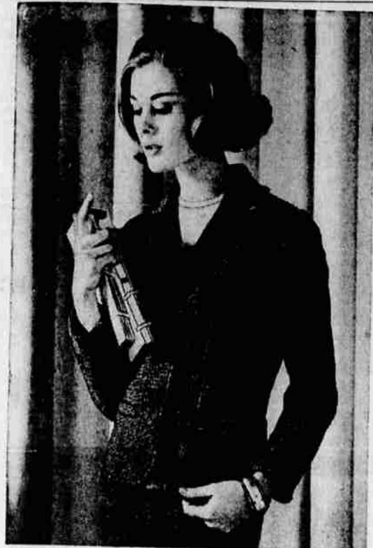
HAS NEW TOUCH - French tweed has new touch in the white and toast flecks knitted into the green fabric. Pretty, young town suit has flattering new collar and revers edged in self braid, two self buttons and pockets hidden in seam of the deep-cuffed hemline.

Fall millinery is color-bued to autumn fashions in subtle, jewel and rich dark tones. Black and white is a fashion-right color combination that appears again and again in autumn headwear.