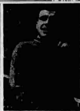
NEW SWEATER - The Continental look shows up in this new zip-front sweater for Fall with its contrasting borders and elbow patches.

Vests, that in some cases even went through the summer season, return for fall in both traditional and high - style fields.