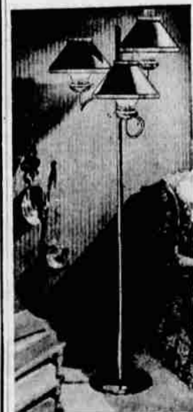
NEW LOOK - Early American lamp shows fall's new slimmed-down look. Polished brass stand holds three glass chimney lamps topped with gold perforated shades.

CHARMING REPTILES Reptile-charming is part of the art of fall fashion, as accessories utilize alligator and lizard, real or fake, for everything from shoes and handbags to jewelry and little vests.