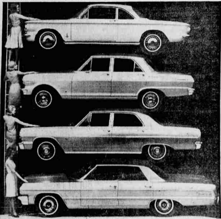
COURTESY CHEVROLET SHOWS '64 MODELS. For 1964, the Chevrolet Motor Division will offer a total of 43 models in five separate passenger car lines, according to Russ Heysell. Each line is distinguishable by its own styling and wheelbase. Above, reading down: the 108-inch wheelbase Corvair Monza Coupe; 110-inch wheelbase Chevy II Nova 4-door sedan; the newest car in the Chevrolet family—the Chevelle Malibu 4-door sedan which has a wheelbase of 115 inches while the Chevrolet Impala sport sedan is built on a 119-inch wheelbase. Not shown is the Corvette Sting Ray which sports a 98-inch wheelbase. Chevrolet dealerships will have a representative showing of all models when the new cars are introduced September 26 at Courtesy Chevrolet, 227 East Ninth street in Medford.