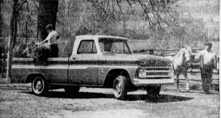
IMPROVED 1964 CHEVROLET TRUCKS SHOWN. Now forward slanting windshield pillar provides roomier door openings for easier entry and exit in 1964 Chevrolet trucks with regular cabs, according to Russ Heysell. Other features include longer lived lamps and exhaust systems, lower transmission hump in most pickup models, more positive door latches, and improved insulation for quieter, more weatherproof cabs. Corvair 95 engines have been increased to 95 horsepower from 80. The new 1964 Chevrolet truck line also incorporates all the major chassis, engine and body advances made under a five-year program which began with 1960 models. The new 1964 models are now on display at Courtesy Chevrolet, 227 East Ninth street.