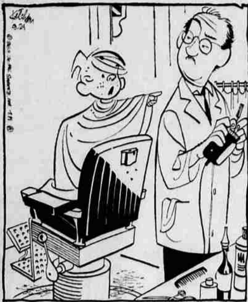
*"A KNOW SOMETHIN'? YOU NEED A HAIRCUT!"*