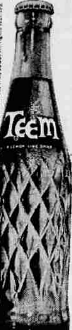
*Gerald McBoing-Boing, strange as it may seem, makes sounds, not words, to tell about Teem!

TAKE IT FROM GERALD... MAKE IT TEEM EVERY TIME JUST ON THE LIGHT SIDE OF LEMON AND LIME!