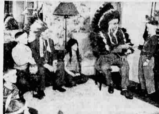
INDIAN GUIDES (SON AND DAD)