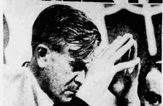
ATTENTIVE LISTENER—Jo Grimmond, leader of Great Britain's Liberal Party, assumes various moods as he listens to speakers during the party's convention at Brighton, England. Some 1,600 delegates attended the assembly, the largest in many years.