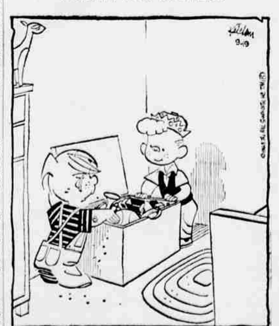
"THIS IS WHERE I KEEP MY TOYS . . . IF I DON'T WANNA BE YELLED AT."