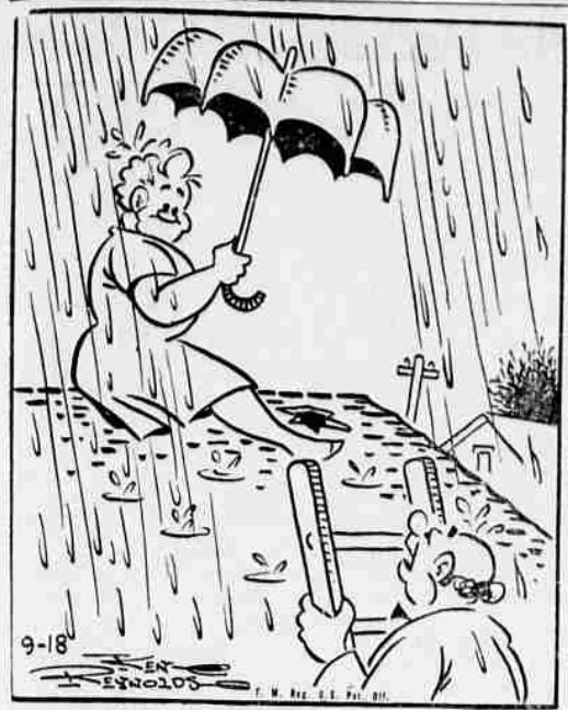
"I called that roofer in the Classified Ads, dear — he'll be here tomorrow!"