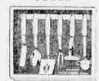
7 1/2" Cook & Serve Sets from $12.95 TV SPECIAL .....$10.17