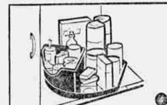
Turntable Bins give divided storage on turntable. Ideal for fruits and vegetables. Color: White Sand, No. 2303. Sizes: 15 1/2" wide x 10 1/2" deep x 7" high. Each $2.95.