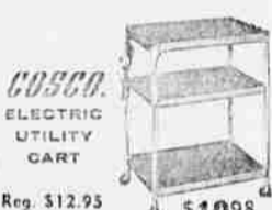
COSCO ELECTRIC UTILITY CART Reg. $12.95 $10.98 Perfect for hold modern kitchen appliances. Twin outlet, 15 amp. supply cord. Chrome frame, enameled shelves.

ASK ABOUT OUR SPACE HEATER LAY-AWAY PLAN