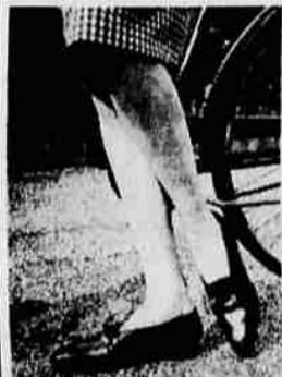
BALANCED OXFORD — For getting down to the real business of walking, the answer is a superbly balanced low oxford of brown calfskin with a flexible composition sole.

Town boots might be slightly higher than the ankle, with plain foreparts and a single buckle, somewhat like a Navy officer's sea boot. Or they might be lower, "more shoe" versions, with plain or moccasin toes. One low type, a cross between a moccasin and a boot, is called