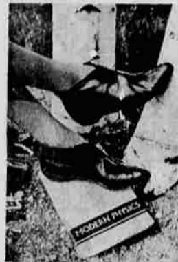
VELVET TIES —For the knee sock crowd, cranberry nylon velvet ties with matching cap and bag, keeping company with brother's brown high-rise oxfords which are cut like jodhpur boots.