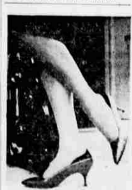
FOR DRESS — For informal dressy occasions Palazzo has fashioned a high-heeled dandy of matte bronze calfskin with an intricate counter top of dark brown suede.

Fashion in children's shoes emphatically has its place, but it must always follow the prime considerations of health and good fit. The National Shoe Institute stresses the importance of frequent size checks and careful shopping. Today's shoes for the young are well made and well designed. It remains only for the responsible parent to make sure that the proper size and correct last are chosen.