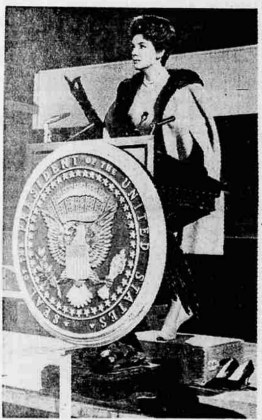
INAUGURAL SPEECH—Actress Polly Bergen, portraying the first woman president of the United States, is caught with her shoes off as she makes her inaugural speech. Although the pose is typical of a woman, the shoes were removed so that she could adjust to a better camera angle in the motion picture.