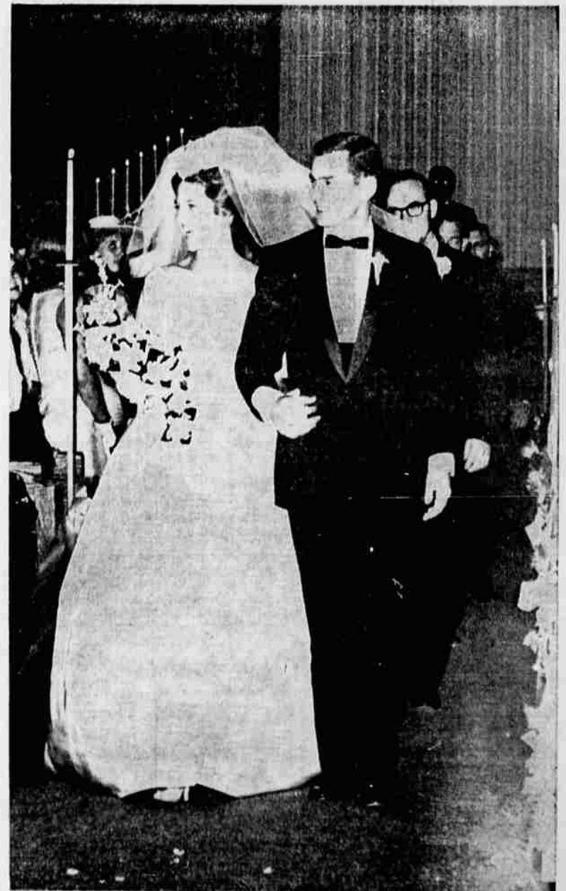
With the solemn ceremony completed, the bride and bridegroom had happy smiles for the friends and relatives who had shared the important hour with them. The former Miss Oregon wore a handsome gown of ivory bridal satin appliqued with lace.