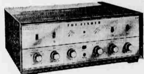
FISHER X-100-B 50-WATT Master Control Amplifier