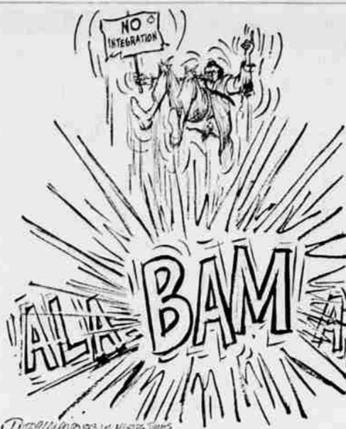
"I'm governor of this state...!"