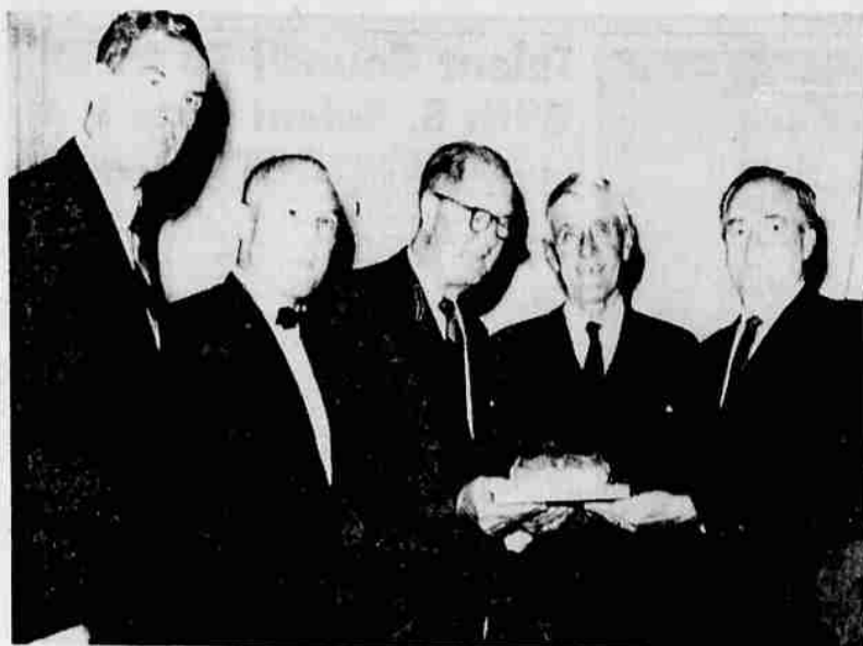
AWARDS PRESENTED — Four Congressional members who were recipients of the American Political Science Association's distinguished service award chat with Sen. Hubert Humphrey (D-Minn.) after the awards ceremony in Washington. The awardees are, from left, Reps. George H. Mahon (D-Tex.) and Thomas B. Curtis (R-Mo.), and Sens. Clinton P. Anderson (D-N.M.) and Leverett Saltonstall (R-Mass.). They were honored for their work during the 87th Congress.