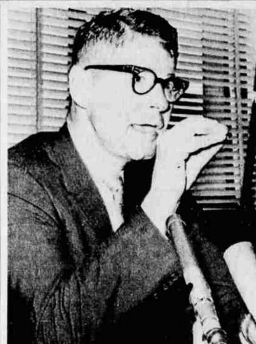
SERIES OF MEETINGS—Agriculture Secretary Orville Freeman, above, has announced a series of 13 "report and review" meetings throughout the country during the next two months to find out what farmers are thinking.