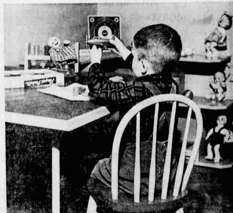
The Jackson County Family and Child Guidance clinic, is sponsored in part by United Crusade contributions. In addition to counseling emotionally disturbed children, the clinic assists educators and those referred by other professions in family and marriage counseling. The clinic now has three psychiatric social workers on its staff, in addition to other personnel.