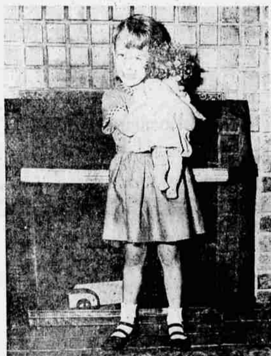
A contribution to the United Crusade can bring a smile to a small girl's face when she receives her first doll, a gift from one of several agencies which provide services for children. Among these is the Boys and Girls Aid society which provides specialized social services for children, foster home care and adoptive service.