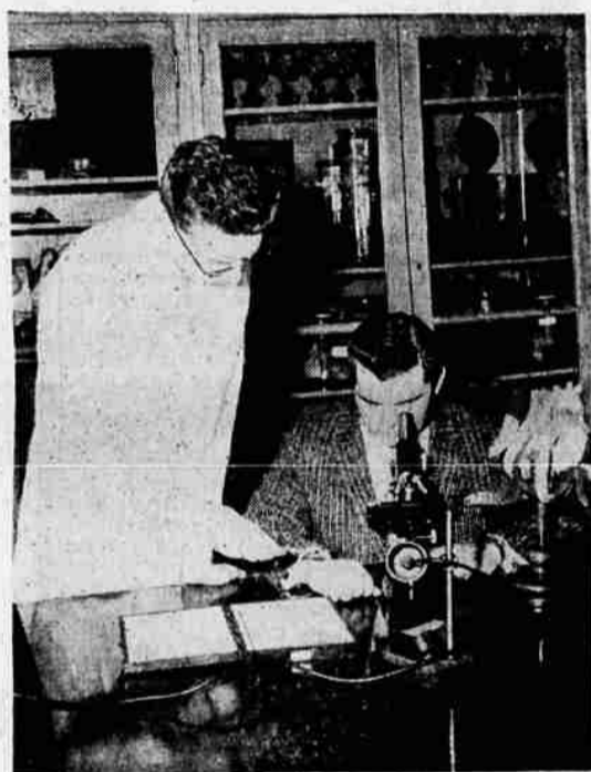
Every cent of the $3,500 allocation to the University of Oregon Medical Research Foundation by the United Crusade is used for research. Donors may designate gifts for particular research. The medical school has an international reputation in health research: it has the largest primate center in the world.