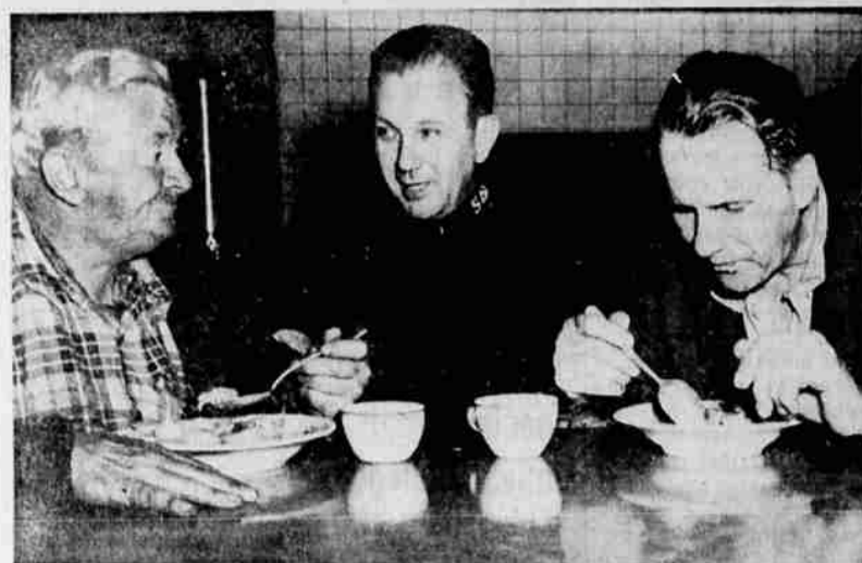
Emergency food, clothing and shelter for families and individuals are available through the Salvation Army, supported by United Crusade contributions. At the Medford shelter last year 7,042 meals were served and beds were provided for 2,964. Another Salvation Army program is the White Shield Home and hospital in Portland which offers adoption service and care for unwed mothers.