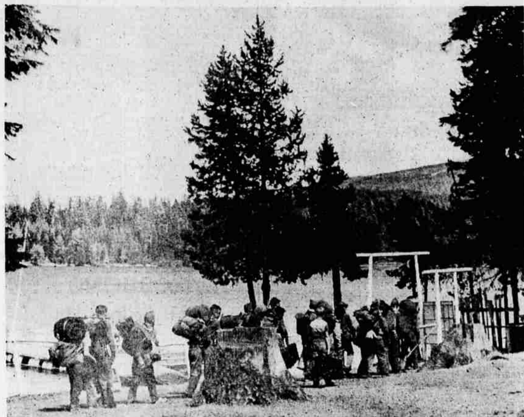
Activities of the Boy Scouts of America and Rogue Valley Girl Scout council are among the agencies supported through the annual United Crusade in Jackson county. The 1963-64 campaign has a goal of $180,040 to be used by 20 agencies in Jackson county and Oregon. Training meetings for the campaign workers start Monday evening and will be held nightly through Friday, Sept. 15.