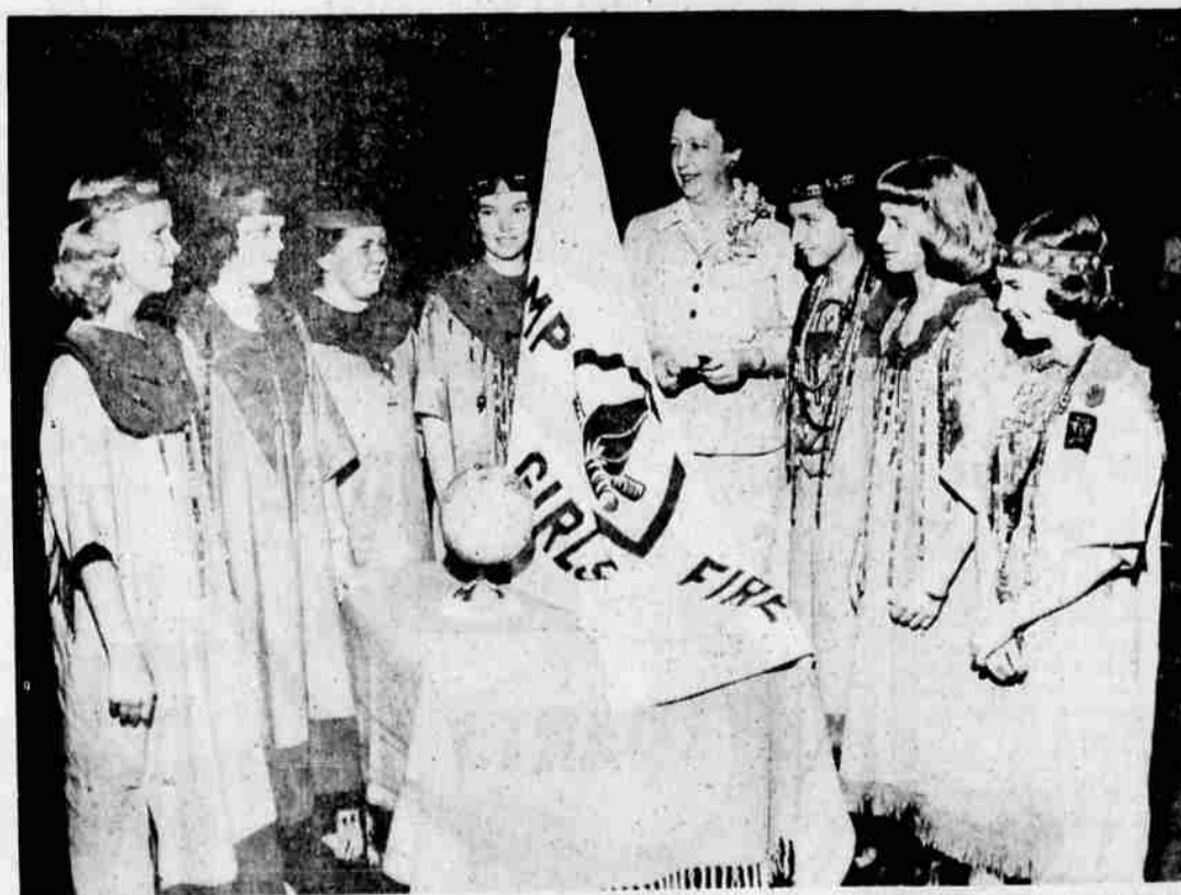
Camp Fire Girls, some 855 strong in Jackson county, is among the programs for youth supported through contributions to the United Crusade. Some 282 volunteer leaders direct the girls from 7 to 17 years.