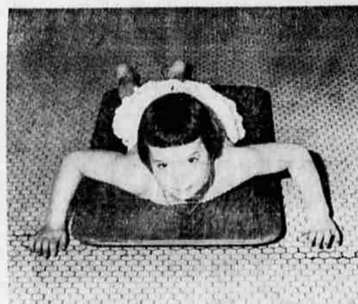
This little girl is being helped through United Crusade money, part of which supports the Arthritis and Rheumatism research projects. Established in 1948 this agency directs patient aid for medically indigent persons, professional education and training.