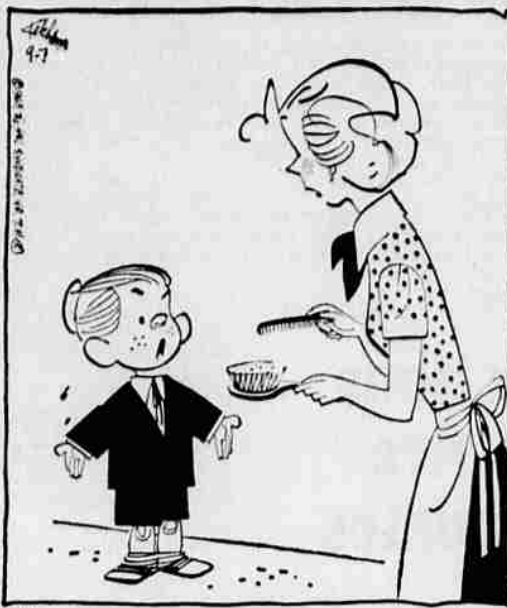
How come I have to feel unhappy before you say I look nice?