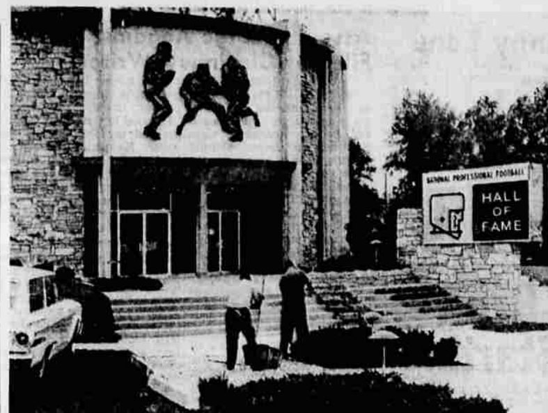
FINISHING TOUCHES —Workmen put some of the finishing touches on the Professional Football Hall of Fame at Canton, Ohio. The building is to be dedicated on Saturday, Sept. 7 and a large group of former pro gridiron greats are to be on hand.