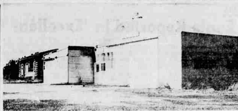
LATEST FIRE HALL —The Talent Rural Fire Protection district has moved its headquarters to these buildings at the corner of Highway 99 and Valley View rd. The buildings have been vacant for about a year. They formerly were occupied by a firm engaged in the manufacture of Alpine logs. A cabin constructed of the logs still stands at far left. The Talent rural fire trucks will be housed in the large building at right. In order to make the move, the department is vacating quarters on Old Pacific highway near Main st. in Talent. The district also owns property at the corner of Main and I sts. in Talent, where a new fire hall will eventually be built.