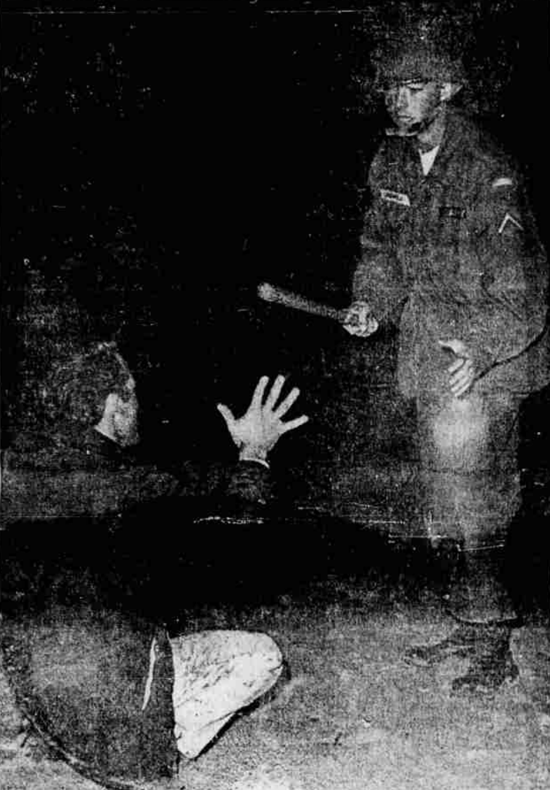
VIOLENCE FLARES —For the second consecutive year, teen-agers rioted over the Labor Day week end in the Oregon resort town of Seaside. In the upper photo, a group of teen-agers is shown pushing over a stand Sunday morning. In the lower photo, a steel-helmeted Oregon state policeman was injured by a flying bottle filled with sand.