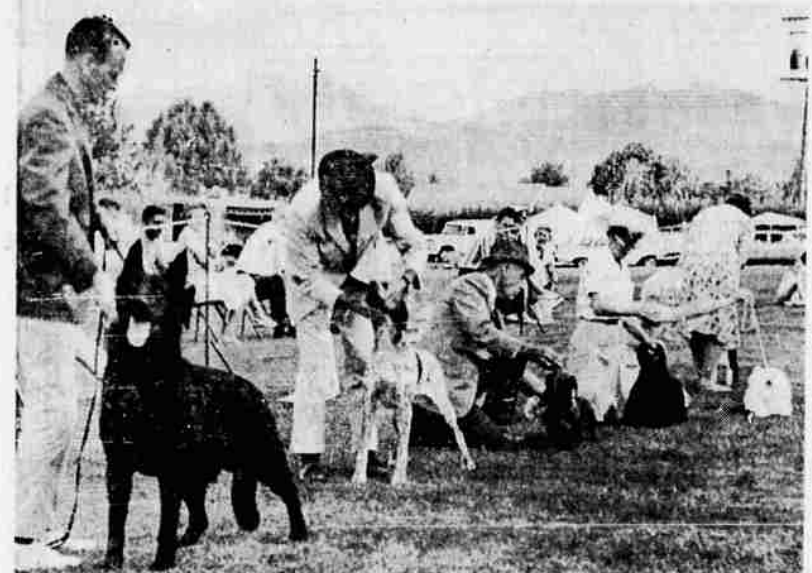
BEST OF SHOW JUDGING —Handlers work on their dogs during the judging for best of show in the all breed dog show and obedience trial sponsored by the Southern Oregon Kennel club Sunday. A German short-hair pointer, second from left, owned by Gretchenhof Kennels, Costa Mesa, Calif., was judged best of the show. He was also rated the winner of the sporting group.