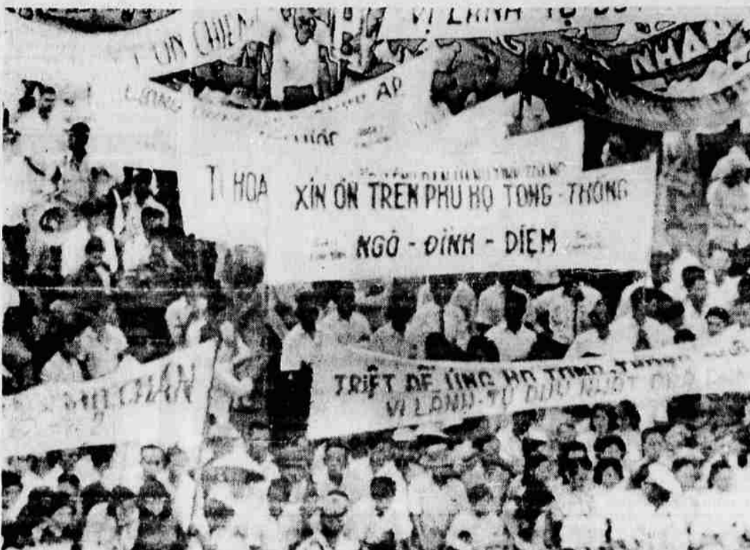
DEMONSTRATORS IN VIET NAM - Banner-carrying pro-Government demonstrators jammed city hall square in front of the U.S. Information Agency in Saigon, Viet Nam Saturday to demonstrate support of the South Vietnamese government's crackdown on Buddhists. The demonstration reportedly came about on the orders of Ngo Dinh Nhu, powerful brother of President Ngo Dinh Diem. About 20,000 took part, although the government press claimed 200,000 had been on hand.

Hyannis Port, Mass. - President Kennedy will visit Oregon as part of a 10-state tour of conservation and natural resource areas late in September, the White House announced Saturday.