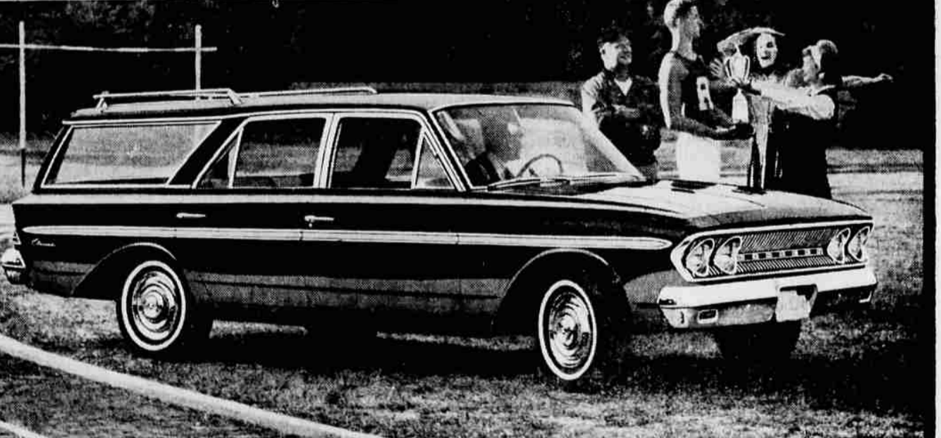
Rambler Classic Cross Country Station Wagon—choose the famous 6 or new 198-hp V-8