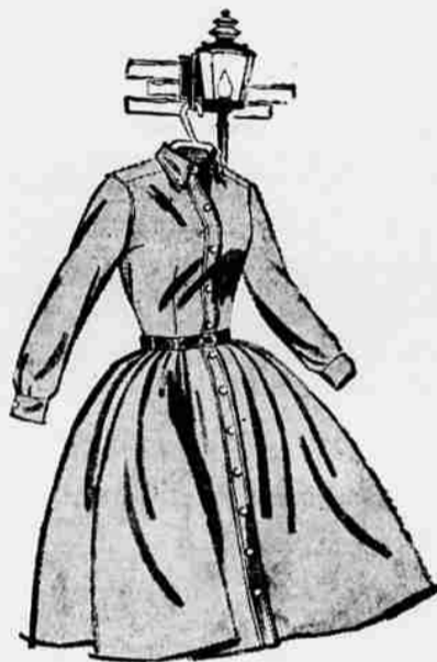
(Above) Country Miss goes to Oxford... for traditional beauty in a tailored shirtwaist. Full skirted, long sleeved, button-down classic in Fall's favorite fabric—crisp woven cotton Oxford cloth. Olive, Teal Blue. Sizes 8 to 16. $16.00

Two Big Favorites... Corduroy and Oxford!