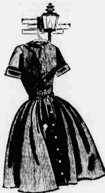
(Right) A classic in Corduroy by Country Miss. Lightweight wide wale, tailored for comfort and casual wear. Cardigan neck, roll-up sleeves, full skirt. In Olive, Cranberry. Sizes 6 to 16. $16.00