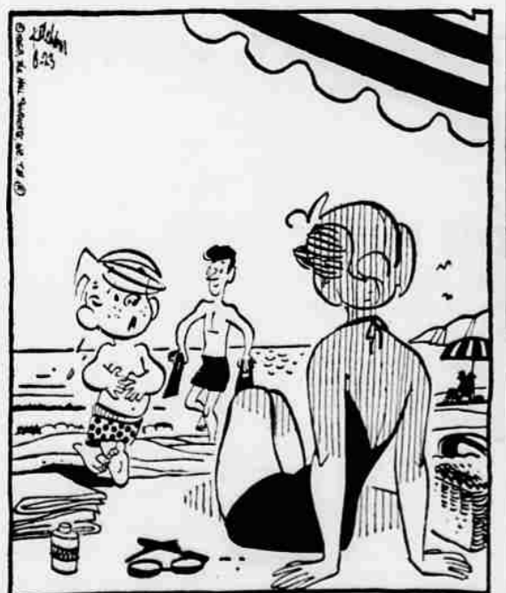
"I DON'T FEEL SO GOOD. I DRANK MOST OF A WAVE!"