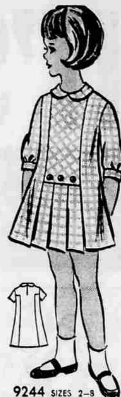
9244 SIZES 2-8 by Italiani Martini