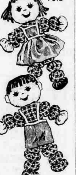
by Alice Brooks

Make lovable dolls of scrap-basket savings. Hair is felt, clothes are odds 'n ends. Easy-to-make cuddle dolls - arms, legs of padded disks make them flop about amusingly. Pattern 7313; face transfers, pattern of clothes, disks. THIRTY-FIVE CENTS (in coins) for this pattern - add 15c cents for each pattern for first-class mailing and special handling. Send to Alice Brooks, Medford Mail Tribune, Needlecraft Dept., P. O. Box 163, Old Chelsea Station, New York 11, N. Y. Print plainly NAME, ADDRESS, PATTERN NUMBER.