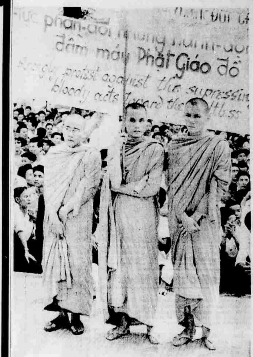
HOLD SIGNS —Buddhist monks hold signs Saigon, South Viet Nam. Services were for protesting religious policies of President Ngo Dinh Diem earlier this week at meeting as a demonstration against the governmental services at main Xa Loi Pagoda in Hanoi.