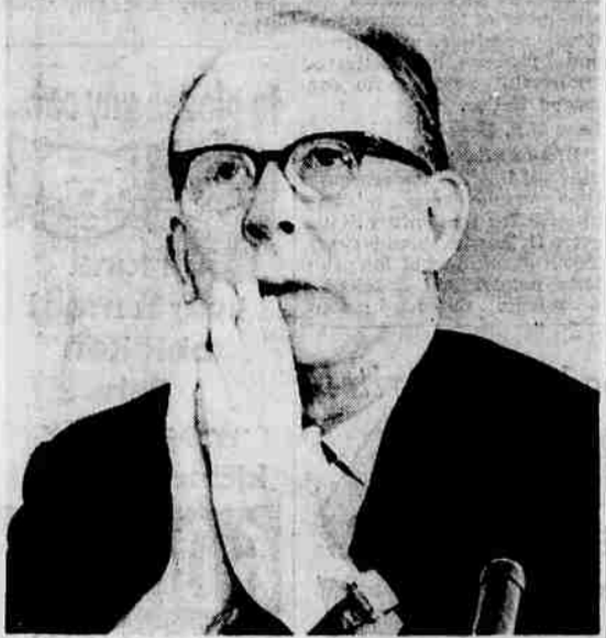
LIBBY WORRIED - Former Atomic Energy Commissioner Willard F. Libby, shown testifying before the Senate Foreign Relations, Armed Services and Joint Atomic committees today, said he probably "would favor" the limited nuclear test ban treaty but is "worried" that the U.S. has not tested a super bomb.