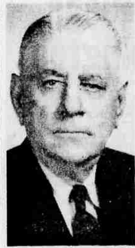
HERBERT S. WALTERS Named to Senate

Washington — (UPI) — Dr. Edward Teller, so-called "father of the H-bomb," testified today that the limited nuclear test ban treaty is not a "step toward peace" but a step "away from safety and possibly a step toward war."