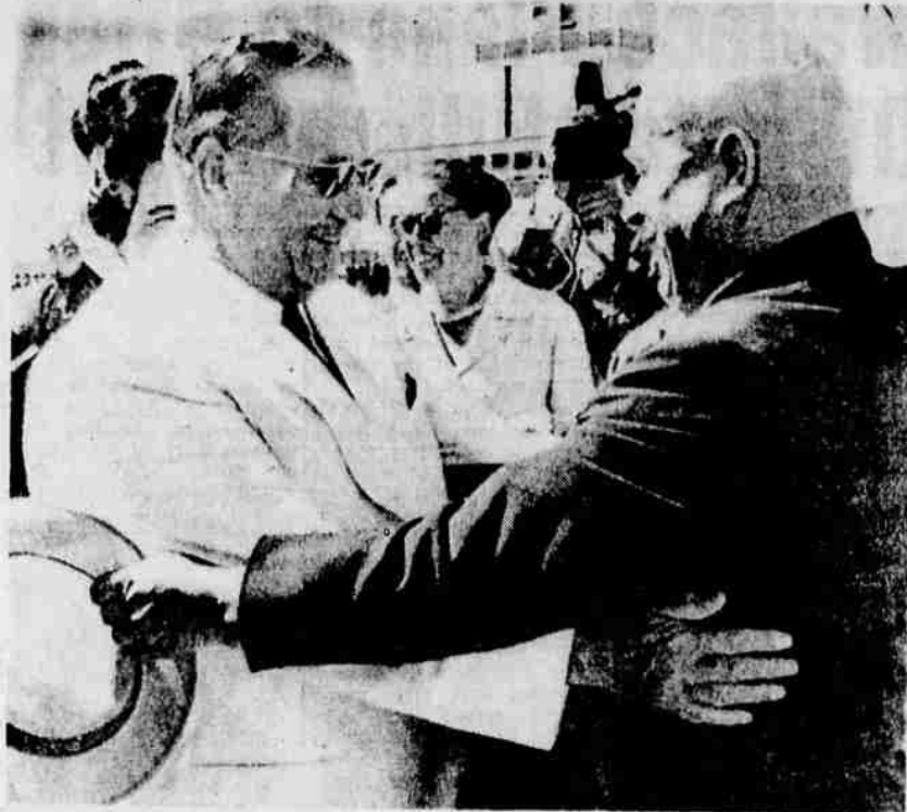
WELCOMED ON ARRIVAL—Soviet Premier Nikita Khrushchev, right, is welcomed on his arrival in Belgrade, Yugoslavia, today by Yugoslav President Josip Broz Tito.