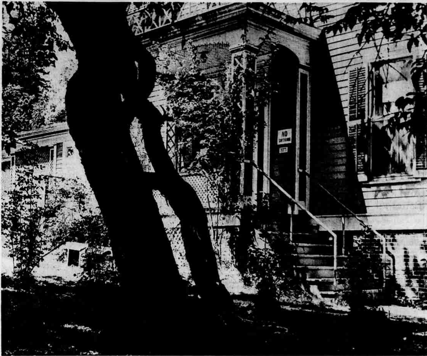
Back in 1880 a Jacksonville banker, Cornelius C. Beekman, built a new family home on California street. The two-story frame structure, with steps leading up to porches and a picket fence enclosing the large yard, was much like those being erected in many small western cities for prosperous businessmen and farmers. Today, in fine condition and with its furnishings almost completely intact, Beekman house is maintained as a historic spot, open to the public, where the visitor can have a glimpse of a typical way of life in the 19th century. A catalpa tree shades the front yard and a huge trumpet vine, probably as old as the house, spreads its fronds and scarlet flowers along the tree's limbs.