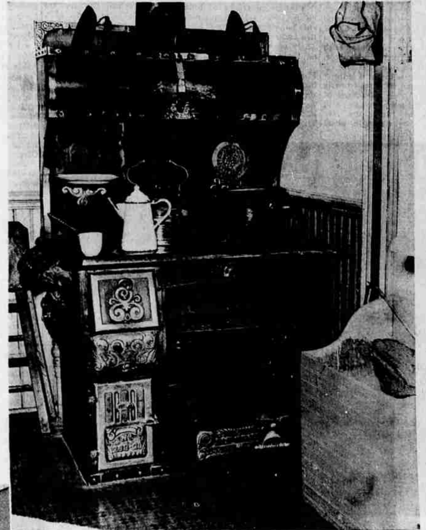
When Banker Beekman and his family lived here, meals were prepared on this sturdy black range which would still give service if the need arose. The family teakettle, coffee pot and irons are kept clean and polished, and the woodbox is filled with wood. The little kitchen table is set with cups and saucers and last Tuesday a little bouquet of nasturtiums brightened one corner.