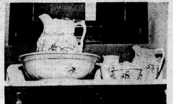
This very old rosewood commode and china set in one of the Beekman house bedrooms usually puzzles the youngsters who have never known a house without plumbing and running water.