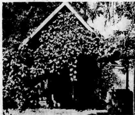
Called fruit, or spring, houses, these little structures of brick were a familiar sight in the late 19th century. A grape vine provides shade and an artistic setting for this one.