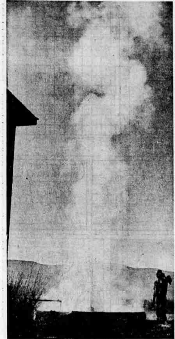
HOT SPRING —Radium water with a temperature of 220 degrees forms Cedar Springs six miles east of Cedarville, Calif., in Modoc county.