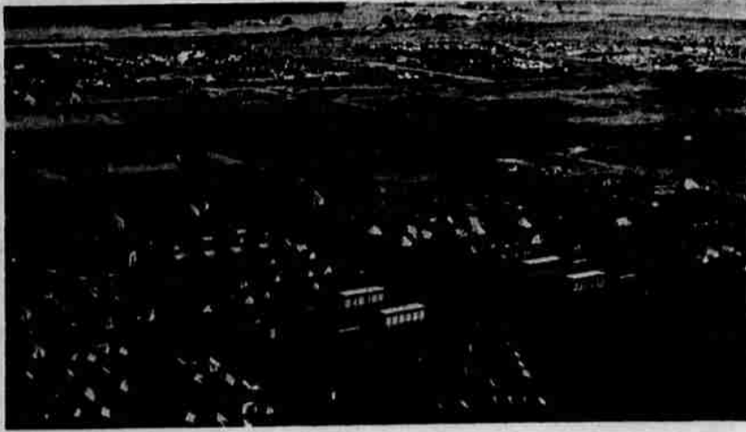
SCOUT JAMBOREE —This is the site of the 11th World Jamboree in Marathon, Greece, which is being attended by three Scouts from the Crater Lake Area Council. The Jamboree site is about 26 miles from Athens on the plain of Marathon.