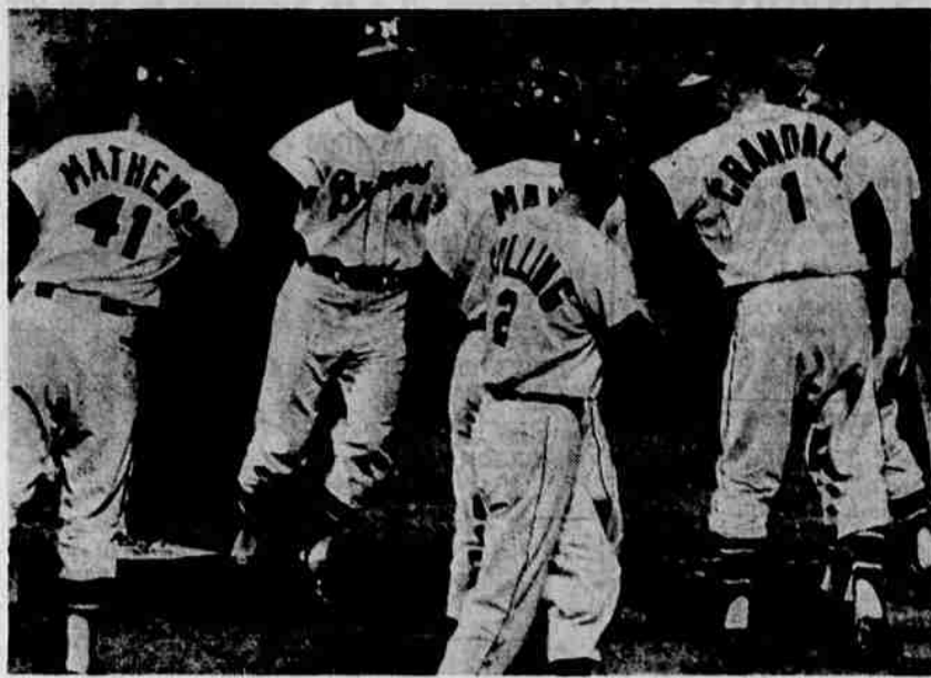
GREETERS —Hank Aaron, Milwaukee Braves rightfielder had all kinds of greeters as he crossed home plate yesterday after hitting a grand slam home run off Los Angeles Dodgers' pitcher Don Drysdale in the seventh inning at Milwaukee, Wis. From left are Ed Mathews, Frank Bolling, Lee Maye and Del Crandall. The Braves won 5-3.

ROXY ANN ROCKETTES A meeting of Roxy Ann Rockettes Bowling league will be held at 9:30 a.m. Tuesday, Aug. 20, in the nursery at Roxy Ann lanes. Women interested in joining in a Tuesday morning handicap league are invited to the meeting.