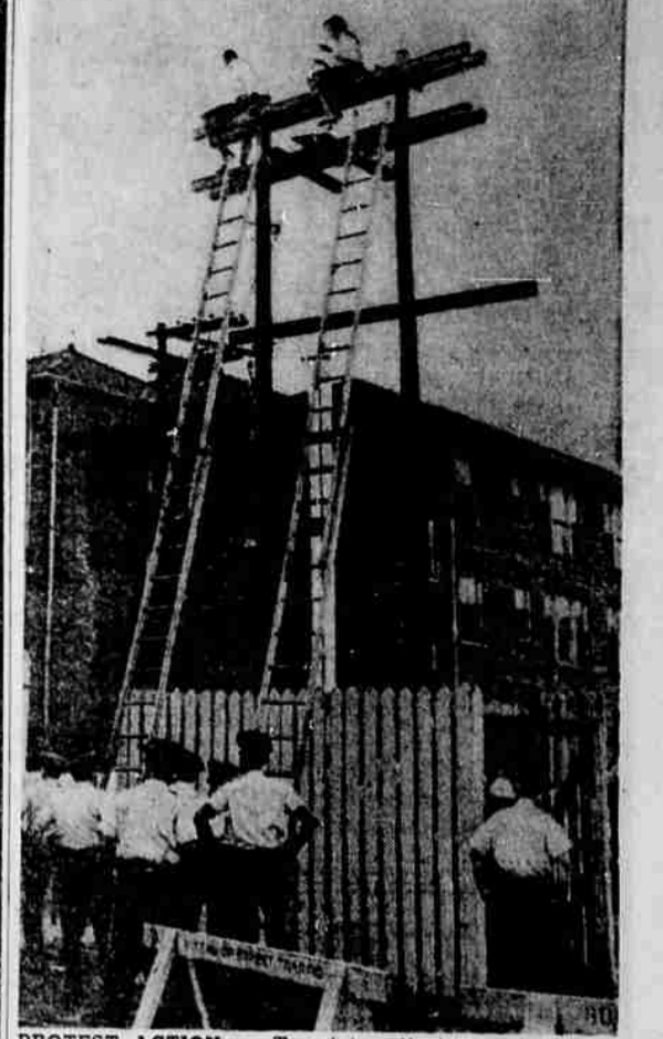
PROTEST ACTION - Two integrationists protesting the setting up of mobile classrooms in a southside Chicago area are shown perched atop a utility pole while police try to coax them down. They were identified as Wayne Yancey, left, and Sybilie Bearskin.

New Many Wear FALSE TEETH With More Comfort FASTTEETH (non-acid powder, holds false teeth more firmly in place, no sticky comfort, just approx. a little P.A.S. powder, party taste or feeling, CHESTNUTS at any drug counter, take to the new product.