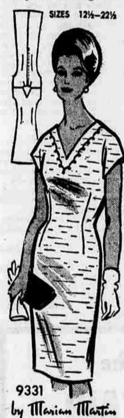
9331 by Marian Martin

Look leaner, taller in a swift-to-sew sheath with no waist seams to interrupt the smoothly gliding line. Choose shantung, Dacron, faille. Printed Pattern 9331: Half Sizes 12 1/2, 14 1/2, 16 1/2, 18 1/2, 20 1/2, 22 1/2. Size 16 1/2 requires 2 1/2 yards 39-inch fabric.