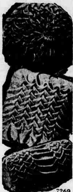
7269 by Alice Brooks

Smocked pillows—easy and fast to do! Use velveteen, corduroy, heavy cotton, silk. New smocked pillows—they are smocked on the wrong side of fabric. Pattern 7269; transfer; directions 12 1/2 in. round, 12 square, 13 1/2 bolster. THIRTY-FIVE CENTS (coins) for this pattern—add 15 cents for each pattern for first-class mailing and special handling. Send to Alice Brooks, Medford Mail Tribune, Needlecraft Dept., P. O. Box 163, Old Chelsea Station, New York 11, N. Y. Print plainly NAME, ADDRESS, PATTERN NUMBER. 1963's Biggest Needlecraft Show stars smocked accessories—its our new Needlecraft Catalog! Plus over 200 fresh-to-you designs to knit, crochet, sew, weave, embroider, quilt. Plus free pattern. Send 25c now!