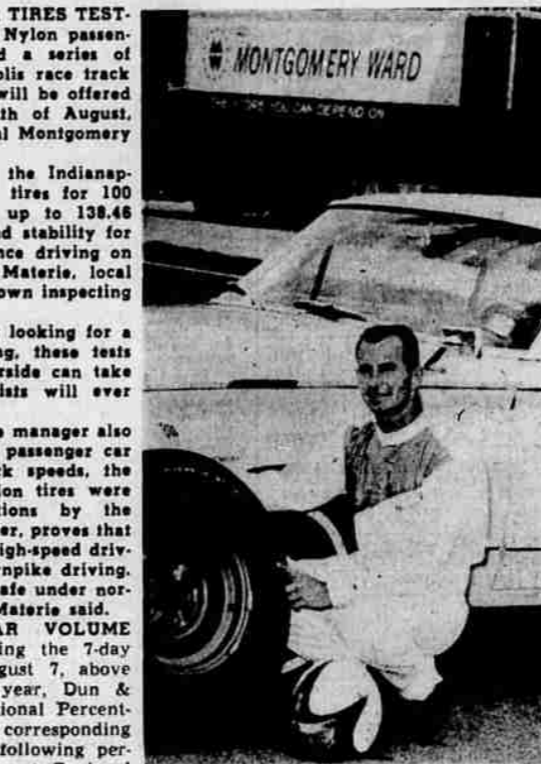
Montgomery Ward store manager also pointed out that while normal passenger car drivers never reach race track speeds, the fact that Riverside ST-107 nylon tires were tested under grueling conditions by the country's foremost race car driver, proves that Riverside tires will withstand high-speed driving far in excess of normal turnpike driving.