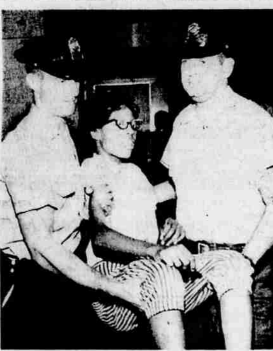
Carried away—Police carry a Negro girl from a building in East St. Louis, Mo., where about 30 demonstrators were arrested after staging a sit-in. The pickets, members of a youth committee of the NAACP protesting hiring practices, entered the building singing hymns and praying. When police arrived they sat down and refused to leave.