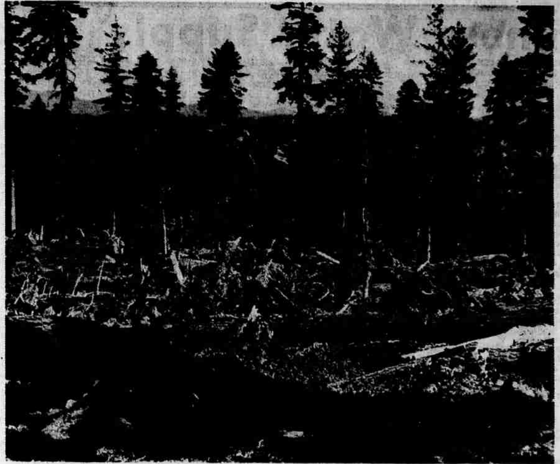
Last Columbus Day, the storm which devastated so much timber in Oregon also resulted in massive blow down in Lassen Park, estimated at some 4,000,000 board feet. A sample of the destruction is shown. Entomologists are endeavoring to protect standing timber from insect damage, and fire-fighting crews have been enhanced to save the blowdown from fire. But the downed trees will be left as a graphic example of Nature's forces.