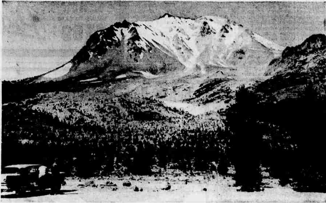
Mt. Lassen, southernmost peak of the Cascade range, is the only active volcano in the contiguous United States. The main feature of Mt. Lassen Volcanic National Park, is a drive of less than five hours from Medford over good highways. This view shows the northeast slope. The giant eruptions of 1915-1917 blew off much of this side of the mountain, and resulted in a cascade of mud, water, rocks and lava which created the "Devastated Area" from which this picture was taken. The small trees in the foreground have all grown up since that time.