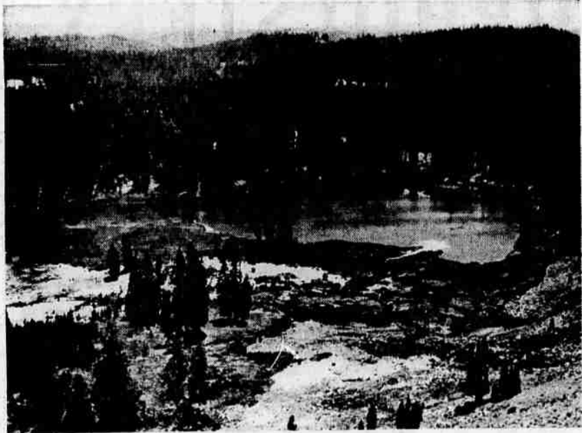
Crumbaugh lake, in the back country of Mt. Lassen Volcanic National Park, is an example of the beautiful wilderness country preserved by the park. This view was taken from a trail circling from Bumpass Hell (where volcanic activity is high) around to King Creek — a relatively easy 3 1/2 mile hike in all.