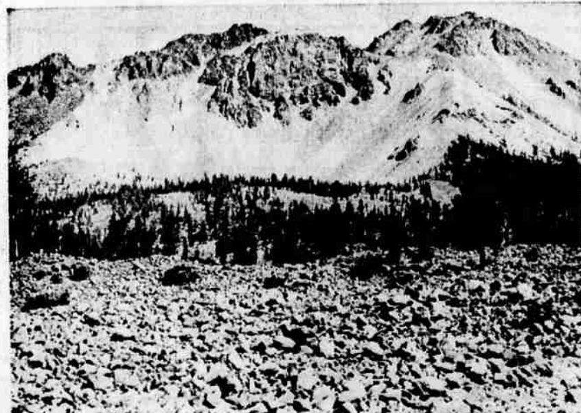
Chaos Jumbles, foreground, and Chaos Crags, rear, are examples of recent volcanic activity in Lassen Park. A huge avalanche swept away a forest during an eruption in the 1915-1917 active period.