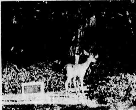
Grazing deer are a familiar site in the Britt gardens, which adjoin the natural wooded area of the Jacksonville hills.