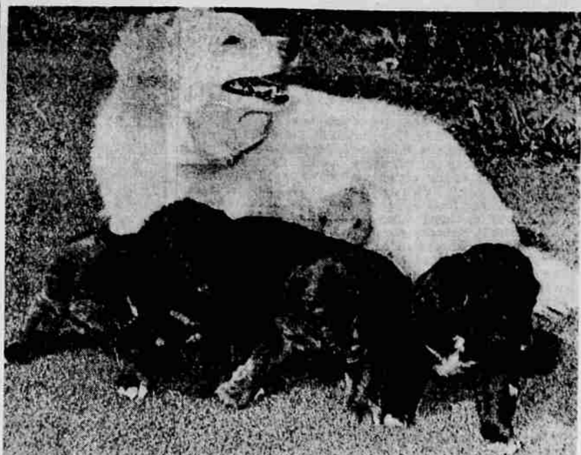
MOTHER AND PUPS —Mrs. Jacqueline Kennedy may give away one or more of the four pups, born to Pushinka, a gift from Soviet Premier Nikita Khrushchev. The pups, who look like their father, Charlie, the White House Welch terrier, are new members of the White House's growing canine family.

Gresham— —Sen. Wayne Morse (D-Ore.) won seven championships with 12 entries of Devon cattle at the Multnomah County Fair here Wednesday. Senator Morse showed the cattle personally. One was a grand champion bull.