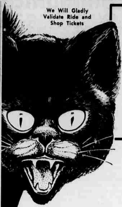
We Will Gladly Validate Ride and Shop Tickets

To report improper or non-delivery of the Mail Tribune in Medford, phone 773-8141; Astoria call at 416 Bridge st., or phone 482-3082; Yreka, phone Victory 2-3098 before 6:45 p.m. daily and 10:30 a.m. Sunday. If regular delivery arrives shortly after you call please notify office, thus eliminating special messenger service.