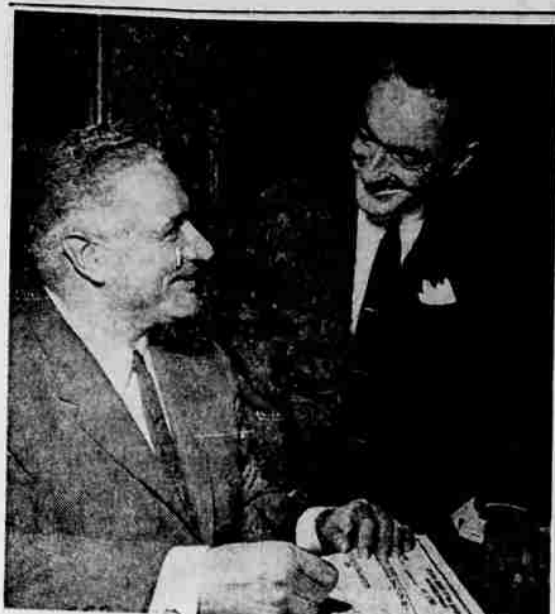
BIG CHECK SIGNED —William E. Miller, right, chairman of the Republican National Committee, and San Francisco Mayor George Christopher are in smiling agreement as the mayor signs an enlarged copy of a check for $100,000 from the City of San Francisco to the GOP National Committee as part of a guarantee securing the party's convention in the city in 1964.