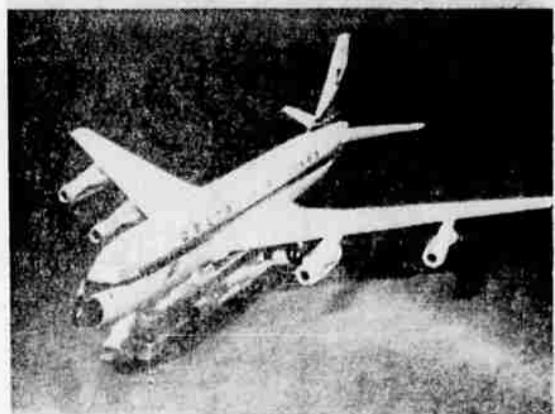
PLANE CARRIER —A new concept for aircraft ground handling—moving the plane by carrying it—is shown in model form as proposed by Roy P. Gibbens of the Martin Co. The aircraft taxis on and off the carrier and can be moved at 20 miles per hour. Annual savings per aircraft in fuel now used in taxiing would be more than enough to pay for the carrier vehicle. The model is on display in Washington.