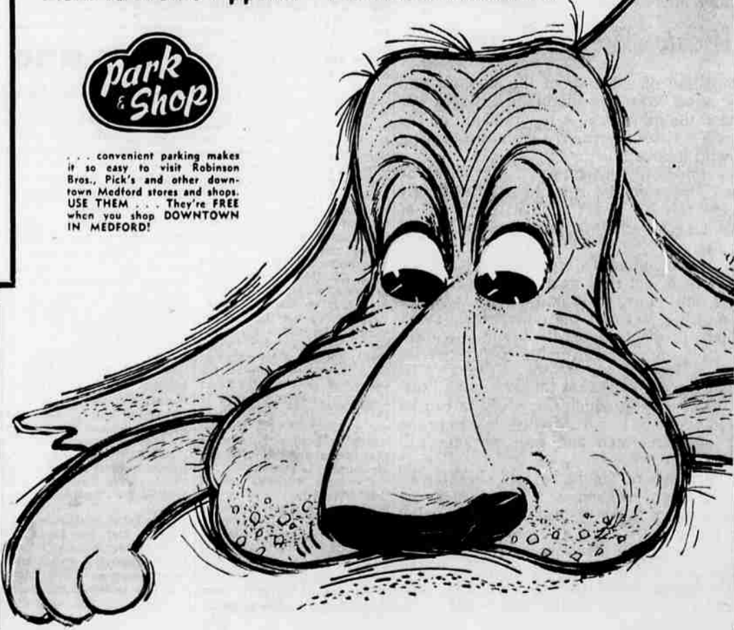
We Will Gladly Validate Ride and Shop Tickets

... convenient parking makes it so easy to visit Robinson Bros., Pick's and other downtown Medford stores and shops. USE THEM . . . They're FREE when you shop DOWNTOWN IN MEDFORD!