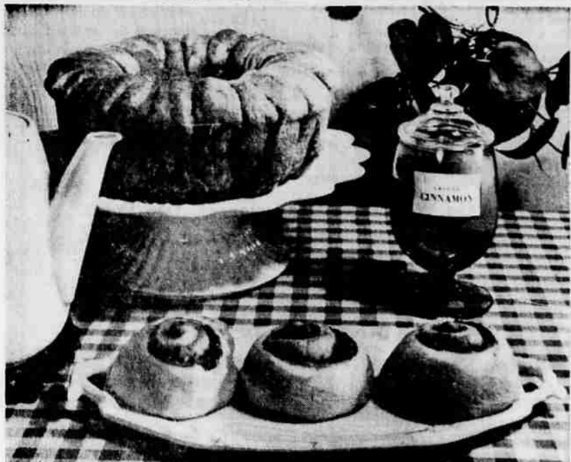
BAKE AHEAD —Given our "druthers" here's what most of us want for our breakfast coffee: Old fashioned coffee cakes, richly flavored with cinnamon, butter and sugar. Bake ahead of time and freeze. They'll taste freshly baked warmed up from the freezer for breakfast weeks later.