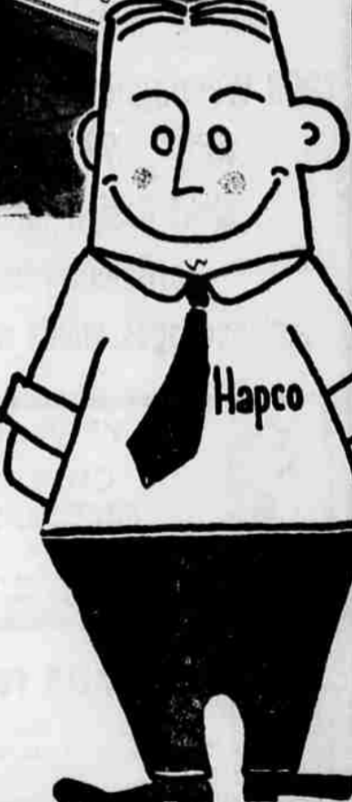
Model CA 276