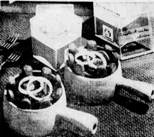
DIETER'S DELIGHT —A full-size serving of this tasty freezer dish contains only 325 calories. (Recipe makes one quart.) 4 frankfurters, split lengthwise and cut in half 1 cup sliced raw celery 1 cup sliced carrots 1 cup onion rings 1/2 cup chopped green pepper 1/4 cup tomato purée Chopped fresh dill or dill seed to taste. Place all ingredients, in order listed, in a large skillet. Cover and cook over a low flame until vegetables are tender (about 15 minutes). Cool and freeze. To serve, place in individual casseroles, cover, and bake in 350 degree oven for 20 minutes.

New York - (UPI) - Cooking out rapidly has become a way of life for Americans. A national study done by researchers for one advertising agency reports that 81 per cent of all U.S. families will cook out this year. They will eat 1.3 billion meals outdoors, spend $100 million on cooking equipment, and $750 million on food for outdoor meals. U. S. citizenship was granted Puerto Ricans in 1917.