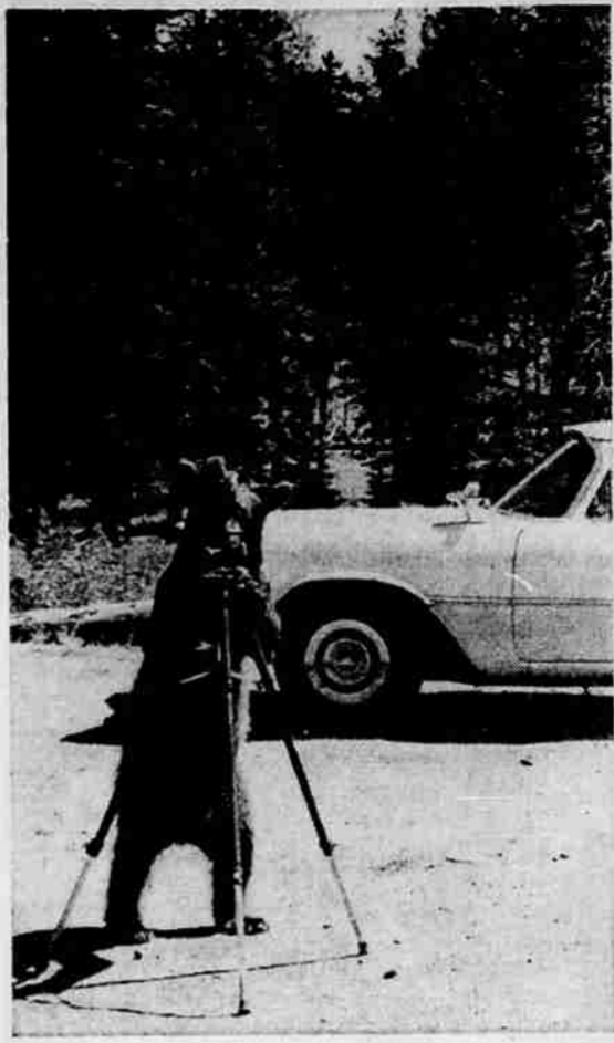
TAKES UP PHOTOGRAPHY—This bear in Yellowstone Park has taken up photography. A visitor to the park was taking movies of the scenic wonders when Bruin came along, forcing the photographer's retreat. The tables were turned as the bear looked through the view finder at the fleeing photographer.

Spartanburg, S. C.—UPI—An Air Force C119 "flying boxcar," participating in the nation's largest peacetime war maneuvers, crashed near here Monday. None of the five crewmen was badly hurt. The Air Force and Army are staging joint exercises, Swift Strike III, in the Carolinas. There was no immediate word on what caused the plane to crash.