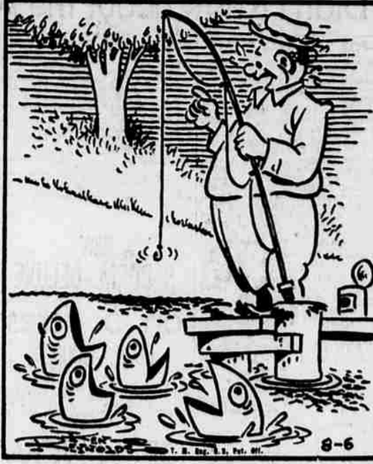
'You fellows wait right here while I look in the Classified Ads for more worms!'

"All we ask for is an equal opportunity so that if one of our four people is equal to the task, he can have a job," said