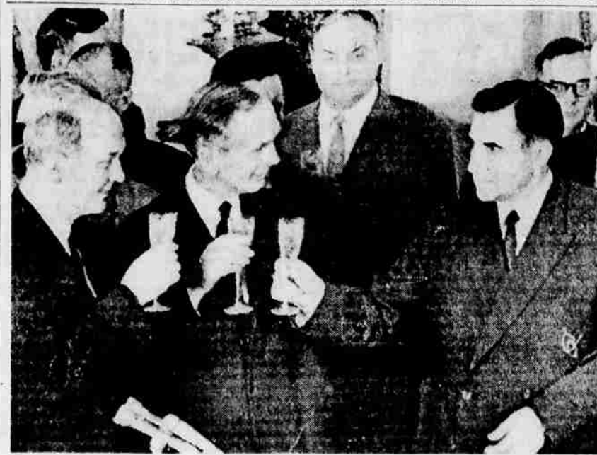
TOAST AFTER SIGNING—U.S. Secretary of State Dean Rusk, left; British Foreign Minister Andrei Gromyko toast each other after signing of a nuclear test ban by Secretary Lord Home, center, and Soviet

SECTION B MEDFORD, OREGON, TUESDAY, AUGUST 6, 1963 PAGES 1 to 8