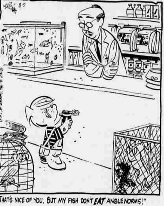
"THAT'S NICE OF YOU, BUT MY FISH DON'T EAT ANGLEWORMS!"