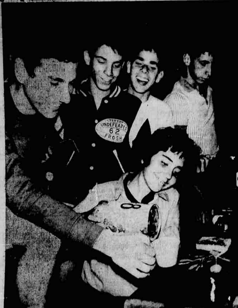
MEMBERS OF GROUP — Members of a group of New York City young people are shown taking refreshments at Jackson campground in the Applegate re-