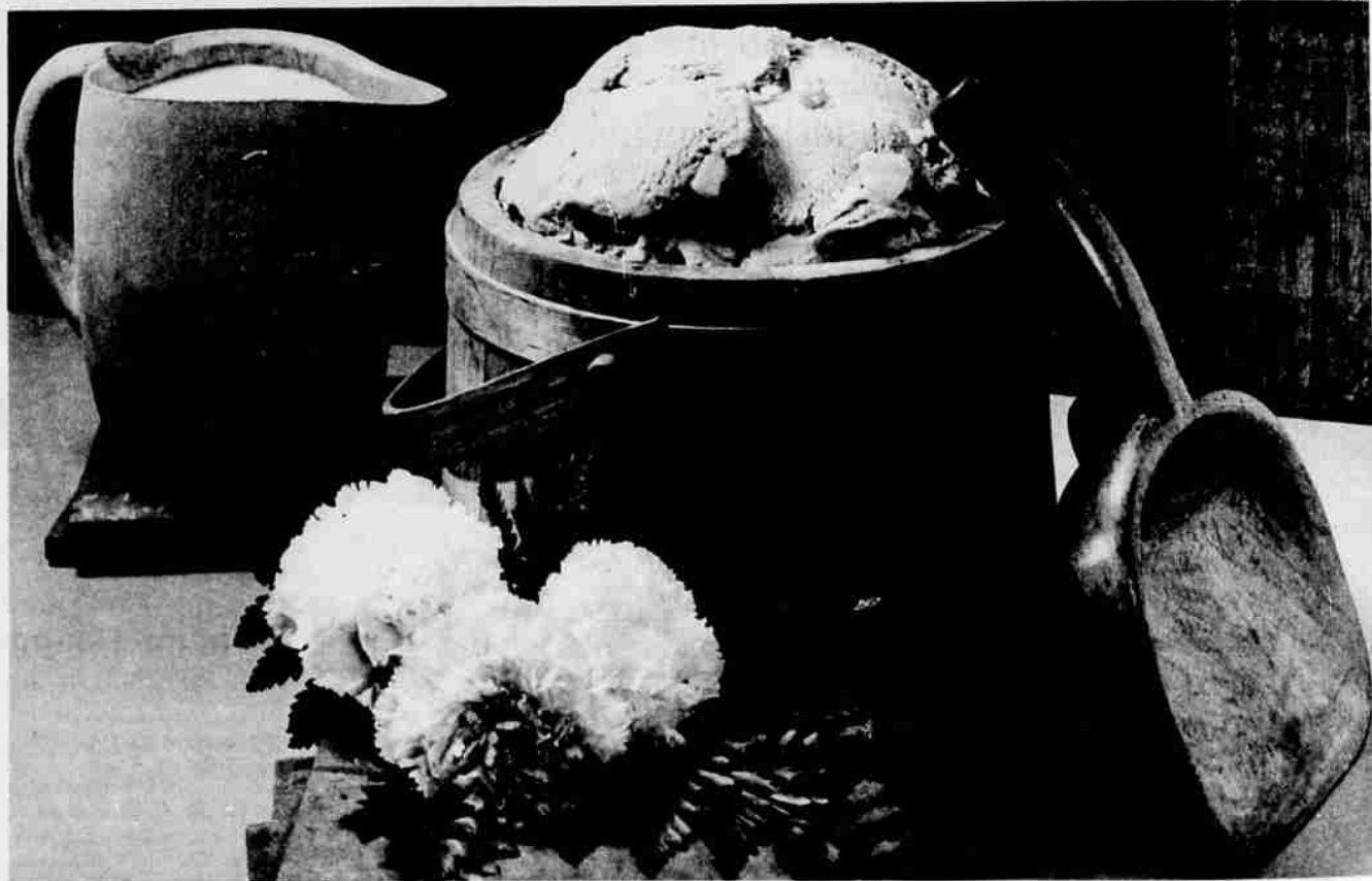
Boys and girls bursting with energy will dip deep for scoops of Caramel-Nut Custard.