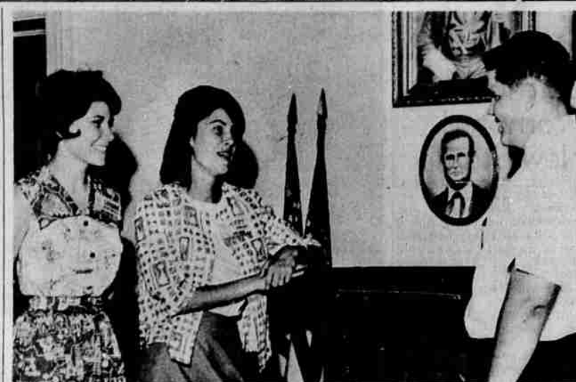
YOUTH VENTURE—Teen-agers from Sacramento district of the Reorganized Church of Jesus Christ of Latter Day Saints are in Medford this week in the Youth Ventures program. The 40 youths must earn half of their expenses for the trip here after completing a six months training course to be