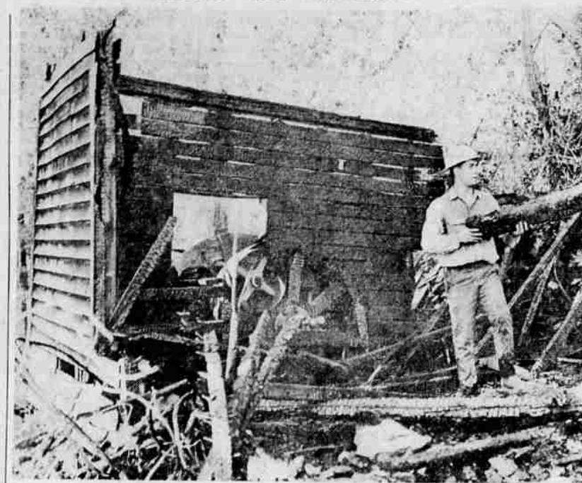
AFTER THE FIRE — The wheel was about all that was saved when fire swept through the Kubli mill on July 12 of this year. This photo, taken shortly after the fire, shows the charred back side of the wheel.