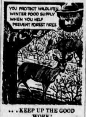
... KEEP UP THE GOOD WORK!