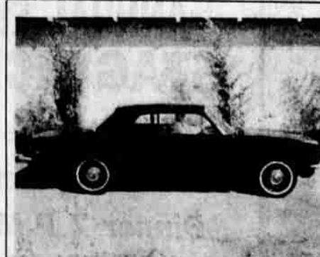
Tempted by a Tempest? I'm burgundy and beautiful . . . a '62 custom coupe . . . $1999.