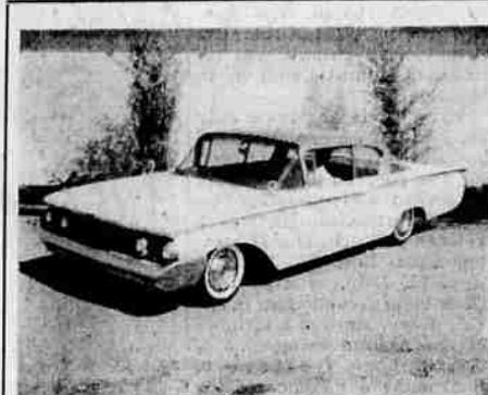
If you've got the money, honey, I've got the power-steering & brakes. Mercury, 1960, $1599!