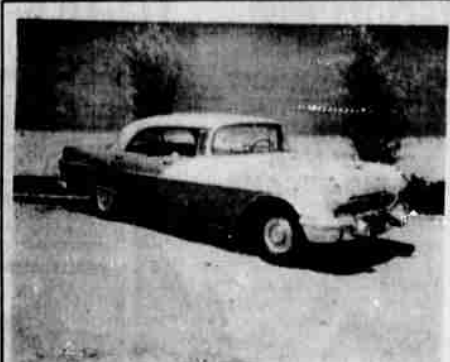
Save your nickels 'n dimes, come out 'n see me, soon. '56 Pontiac hardtop . . . $599.