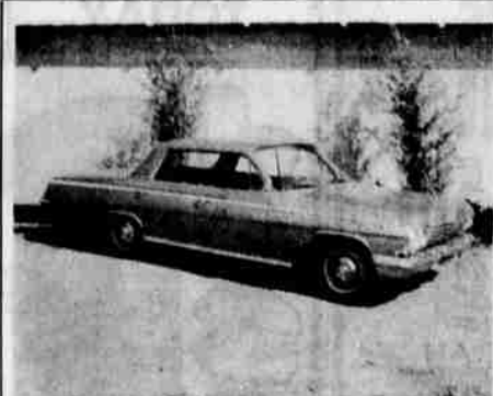
I'm a '62 Chevy Impala . . . wheel! Get up and go with me. Radio, heater, power-steer. $2899.