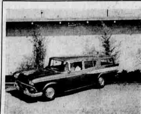
I'm a ratchin', scratchin' Rambler Wagon, '59! Let me take you home . . . SOLD TODAY!