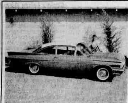
Canyon Copper with ivory top! I'm a '59 Pontiac gem . . . jewel of a price too—$1599.