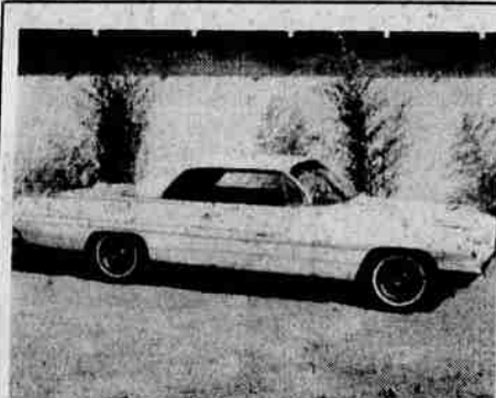
I'm Pontiac's Rolls-royce! An Ivory Grand Prix with red leather . . . every luxury: $3499!