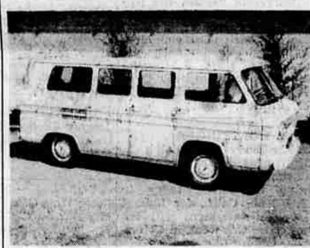
Room for nine . . . have a good time! '62 Chevy Corvair, 4 speeds: SOLD TODAY!