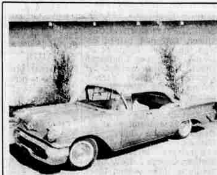
Too late! I'm an Olds, but sold just before we went to press!