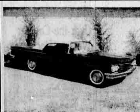
Doesn't EVERYBODY Want a RED '60 Pontiac CONVERTIBLE! Wait 'til you see me . . . $2199!