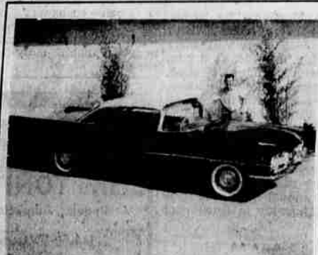
With a car like me . . . who needs a wife? '59 Olds, two-tone . . . $1699.