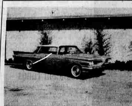
I'm a '59 gold mine . . . to own, to drive. Pontiac Star Chief Vista . . . SOLD TODAY!