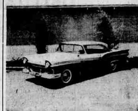
Lucky guy! For $777 you get ME! '57 Ford Fairlane hardtop V-8 . . . with extras!