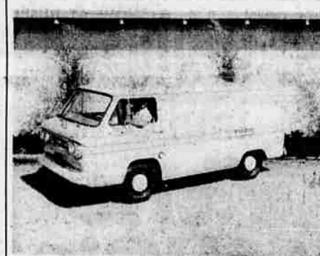
A panel . . . with personality! That's me! '62 Chevy Corvair, I'll go with you for $1699!