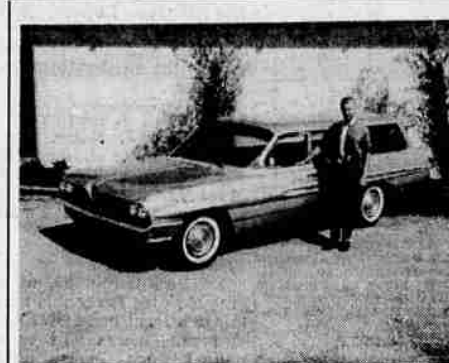
I'm a breeze to drive, a breeze to own. '61 Pontiac Catalina, factory air-conditioned—$2699!