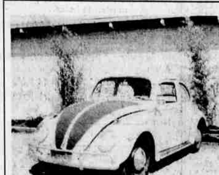
Of course I'm Special . . . only bowlegged Volks out here! 1959 little car for $799.