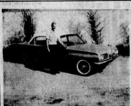
If that guy would get out of the way . . . you'd see I'm a '62 Tempest deluxe . . . $2199!