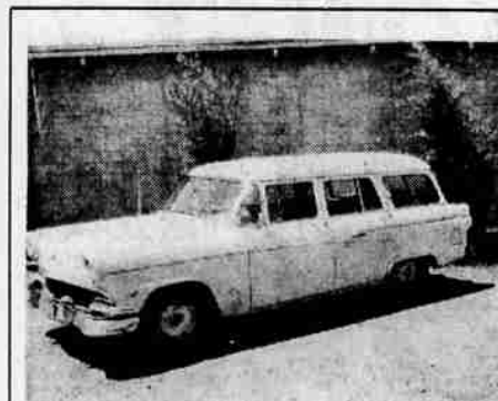
Take me home for $399! I've got miles and miles left. '56 Ford V-8, six passenger.