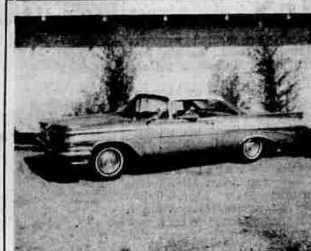
If you're the sporty type . . . I'm for you! A '59 Pontiac, green and white. And, I'm $1799.

asking you to visit our Wide Track Town when you're looking for a used car or truck. We have 3 1/2 acres of good used cars and trucks — the widest selection you've seen. And you'll be surprised how little it costs you to own one! Our cars and trucks, we think, speak for themselves . . .